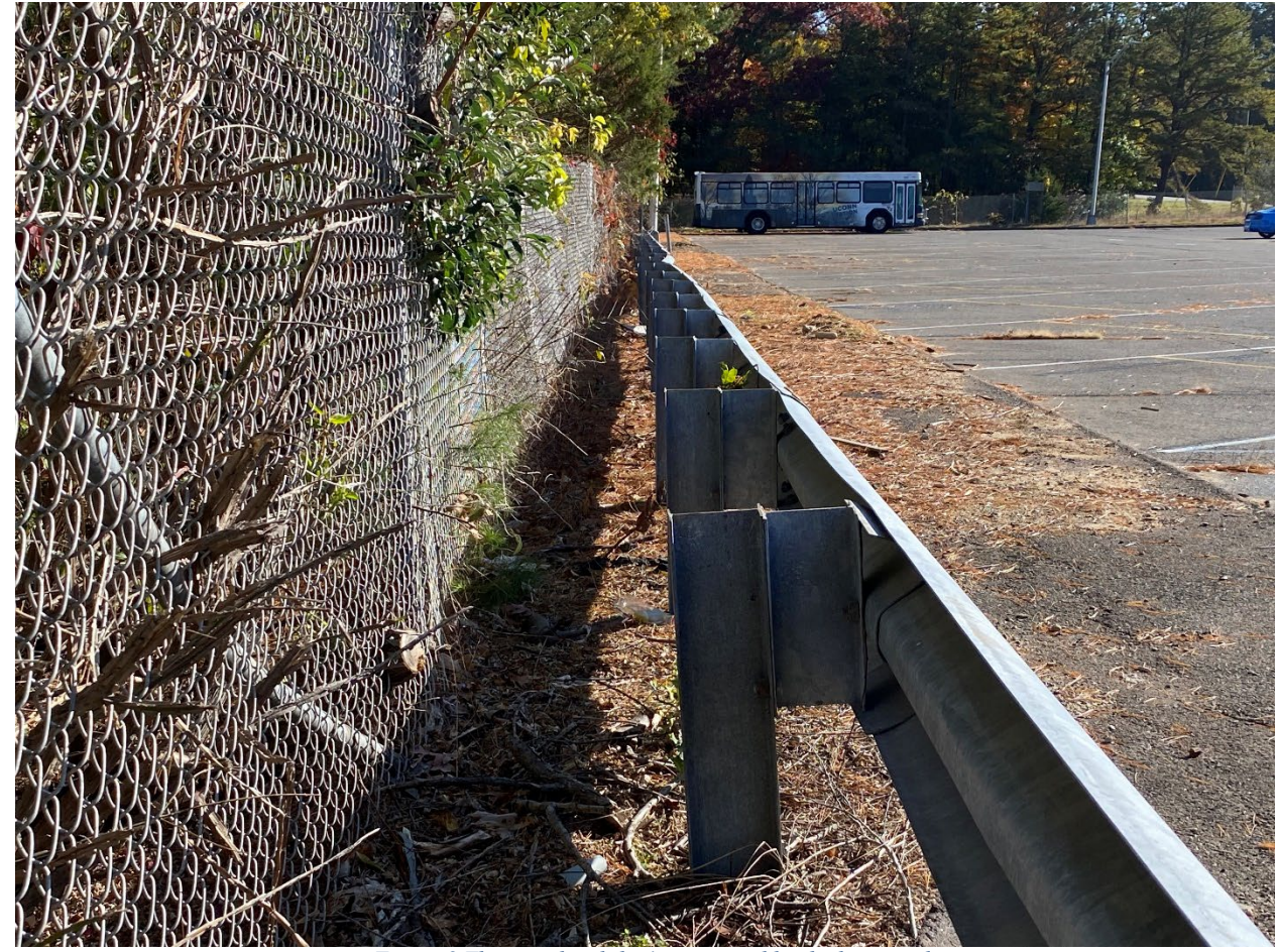
Figure 8 The guard rail that's supported by the beam rails.