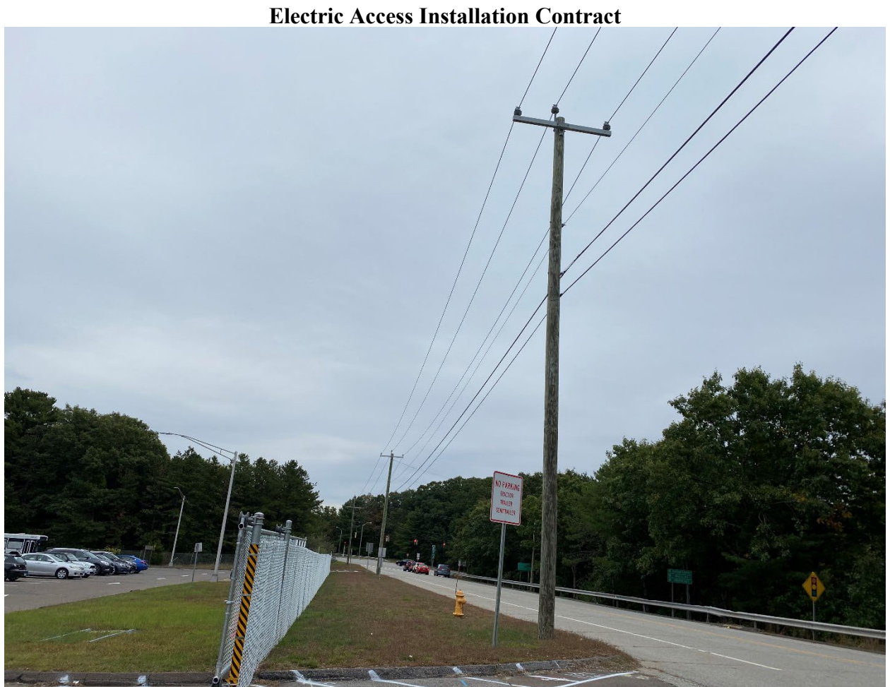
Figure 5 This is the overhead power & communications lines on South Frontage Road. It is desired to bring power from a pole and into the lot.