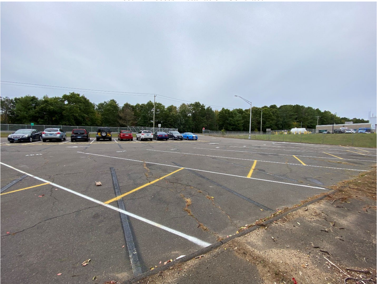
Figure 4 The parking lot is near the Windham Regional Transit District's administration building