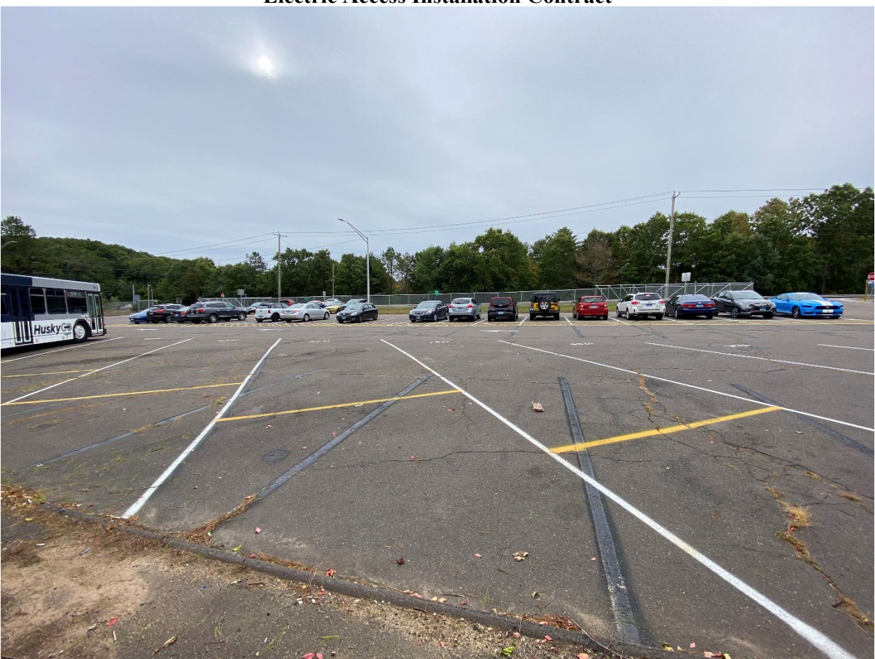
Figure 3 The parking lot is striped, and each bus location is set