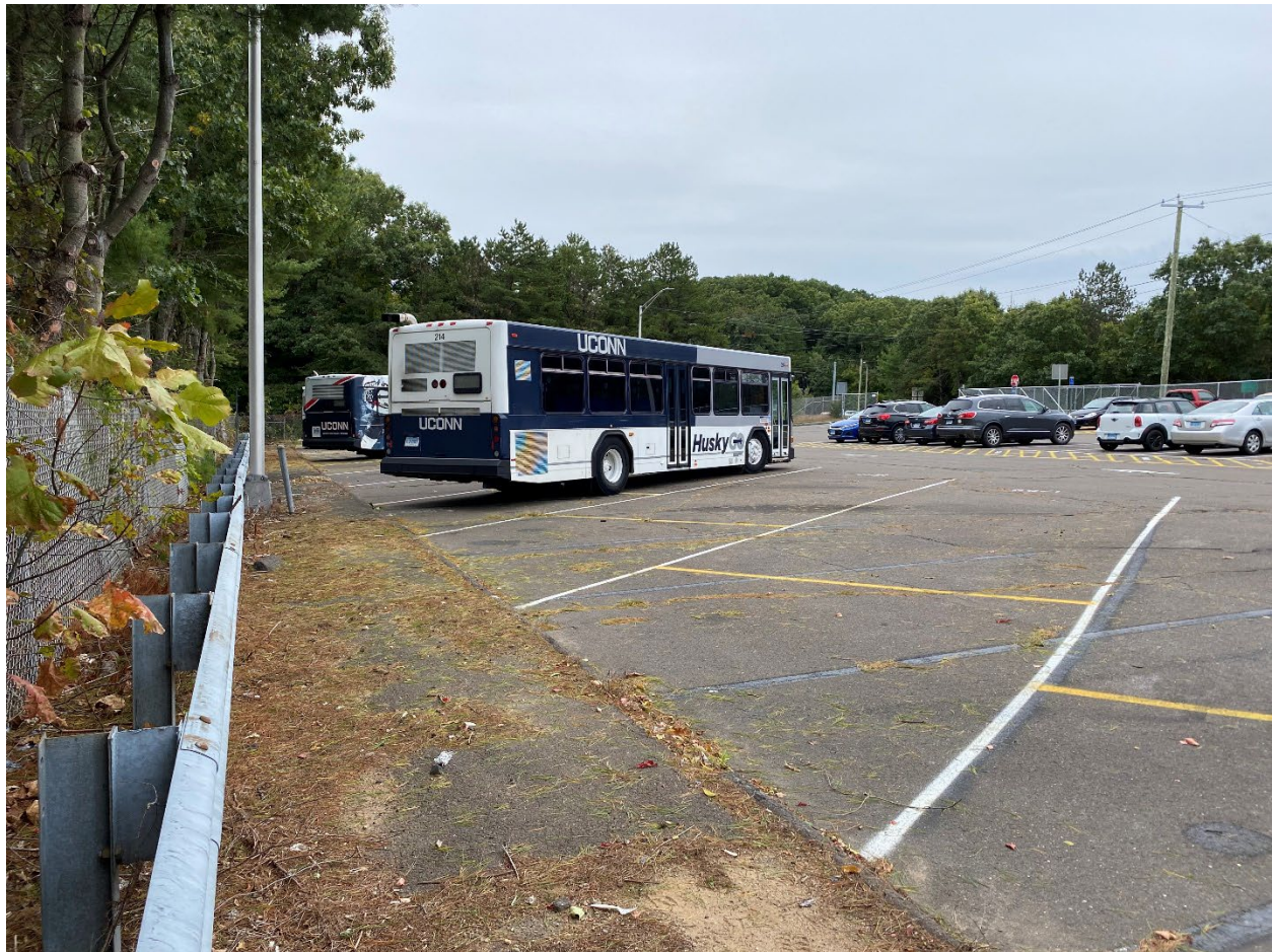
Figure 2 The buses back into the spaces and will need to be connected from the back of the bus. The conduit would be mounted on the back side of the beam rail in lieu of underground trenching. A duplex receptacle will be placed in between two buses.