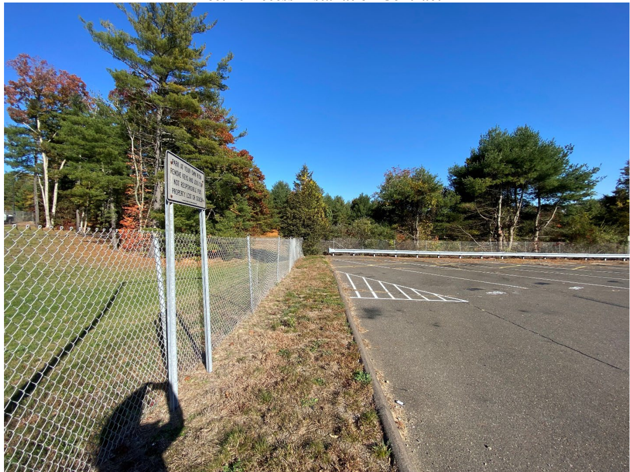
Figure 9 The corner of the park & ride lot where electrical service is needed